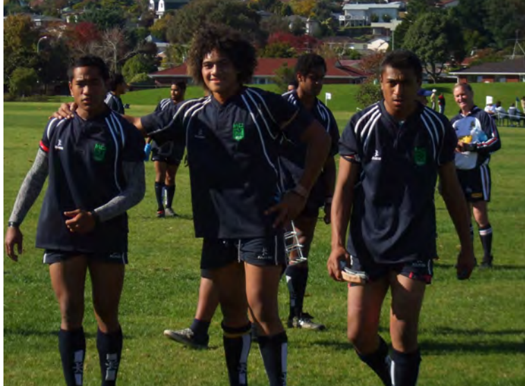
Playing for Mangere College 1st XV in 2010