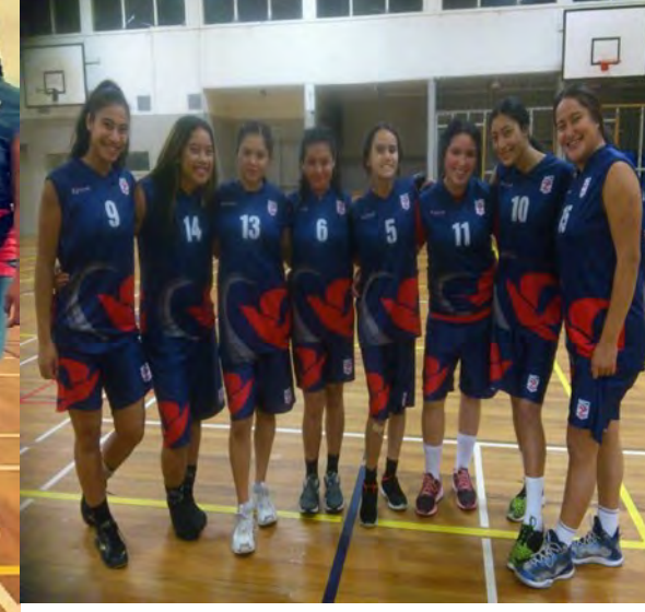
Under 19 Girls Basketball team