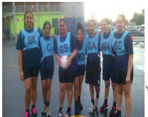
Year 10 B Netball