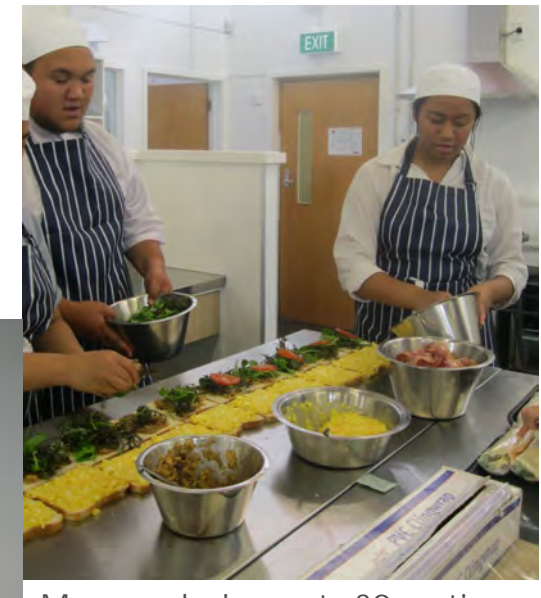
Mass producing up to 30 portions of BLT sandwiches with apple chutney to sell within the school community