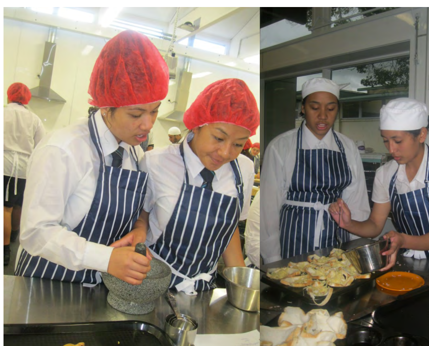
Using a mortar and pestle to make a traditional peanut sauce for satays

These photos showcase NCEA L1 and NCEA L3 Catering students being assessed on their practical skills and ability to follow recipes to produce their assessment dishes.