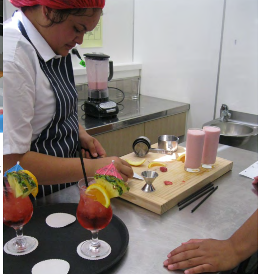
Preparing garnishes for the Mocktail (Summer Punch)