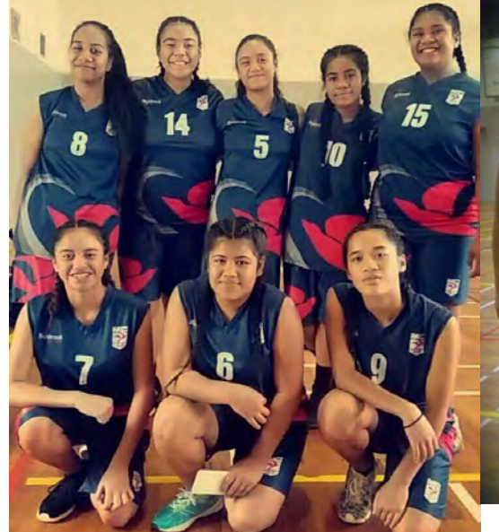
U15 Girls Basketball