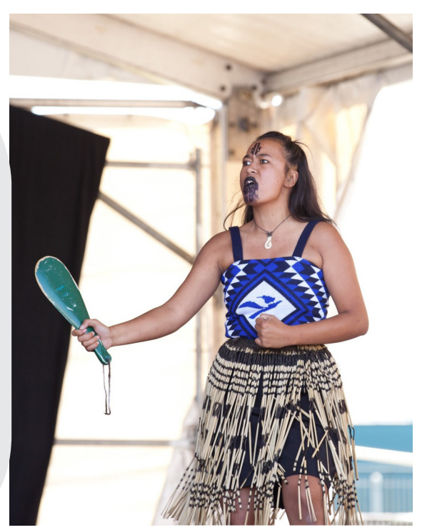
Page 4: Polyfest success