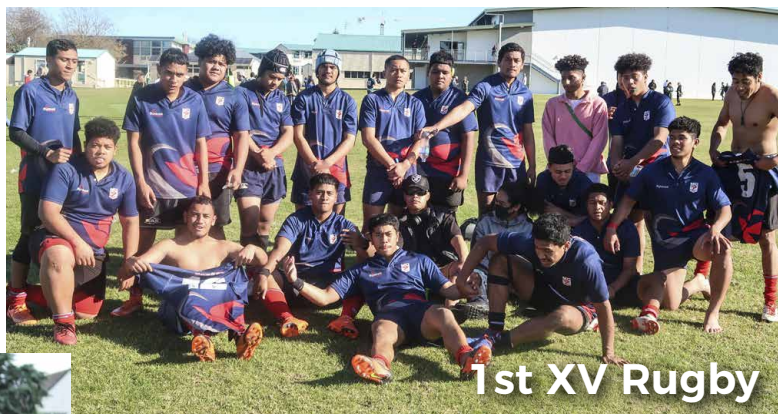
1st XV Rugby

However, we are determined to be patient and positive to continue with our 1st XV rugby team playing on Saturday afternoons and the Girls Rugby team on Monday afternoons.