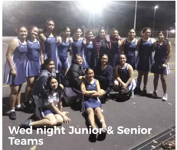
Wed night Junior & Senior Teams