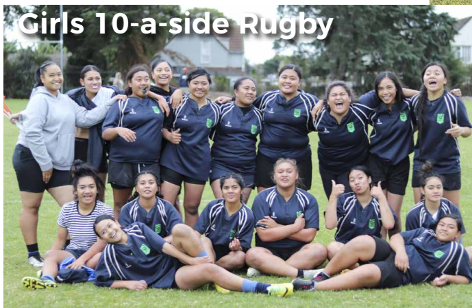
Girls 10-a-side Rugby