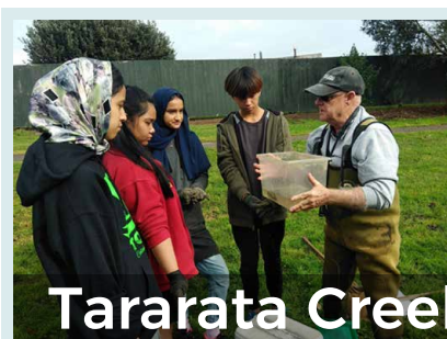
Tararata Creek Planting