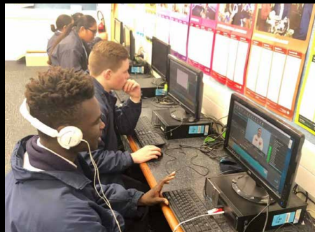
MC Media students editing videos for the Performing Arts Showcase.