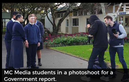
MC Media students in a photoshoot for a Government report.

The MC Media crew have had a productive term with visits from guest speakers, a photo shoot for an up-and-coming Government report, trying out our new camera equipment, a new