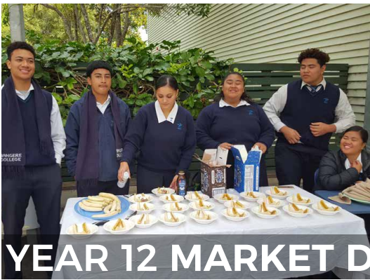
YEAR 12 MARKET DAY