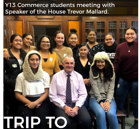
Y13 Commerce students meeting with Speaker of the House Trevor Mallard.