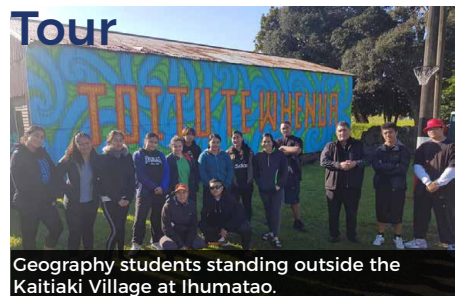
Geography students standing outside the Kaitiaki Village at Ihumatao.