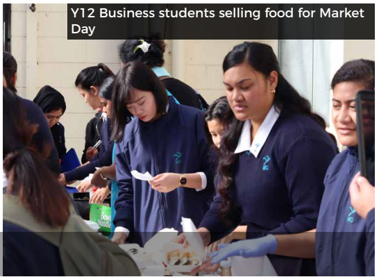
Y12 Business students selling food for Market Day