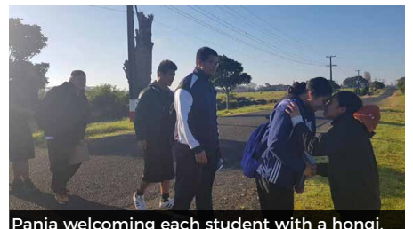
Pania welcoming each student with a hongi.