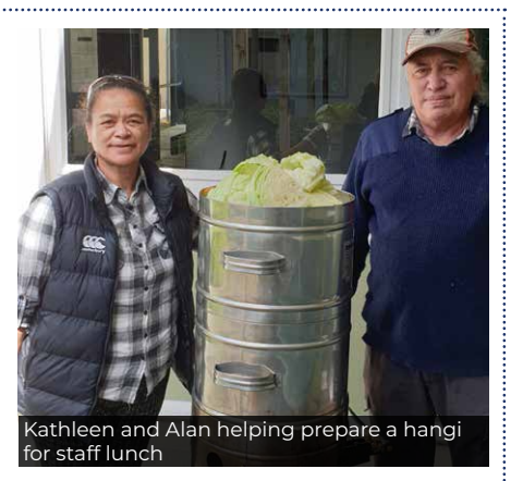
MAORI LANGUAGE WEEK