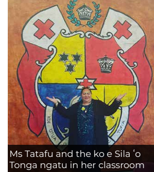
TONGAN LANGUAGE WEEK