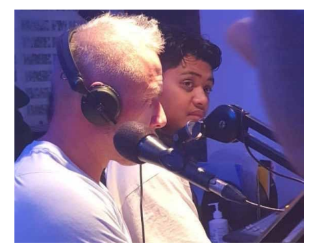
have been shown and I will give it my best shot.