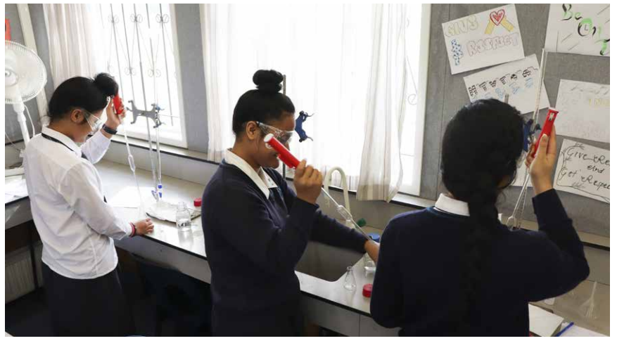
In the images above, students are doing titration to find the concentration of acid in white vinegar. Then they compared their findings to see if the concentration claimed by the manufactures is correct or not.