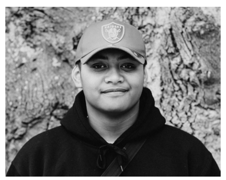
sessions and sessions to come I am keen and engaged to learn and discover more. I am grateful for the support and aroha that I

Every Friday from 4-6pm, I'm live from Base FM, Kingsland (107.3) or channel 71 on TV. Throughout my journey I have gained new friendships, new skills and connections to be ready for the outside world. In these past