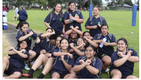
This year we have two Girls 10-a-side Rugby teams: Blue and Red. The first official game was on Monday 29th June against Waitakere College with a win for our Blue team of 29-5.