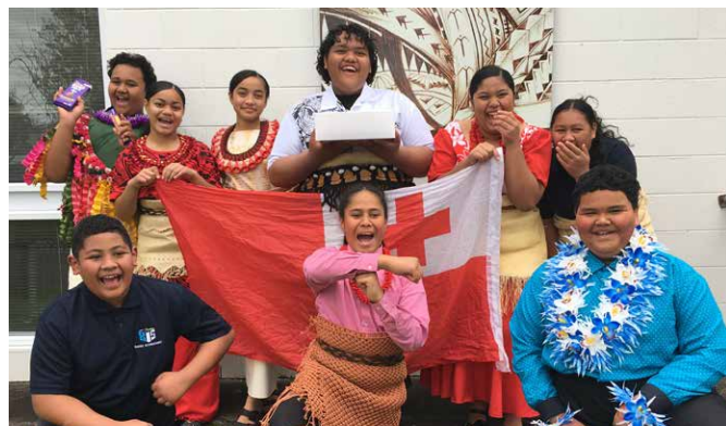
'FIKA IT OUT' TONGAN LANGUAGE WEEK