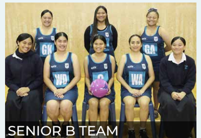
SENIOR B TEAM