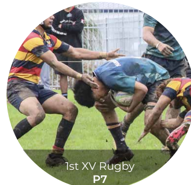
1st XV Rugby P7