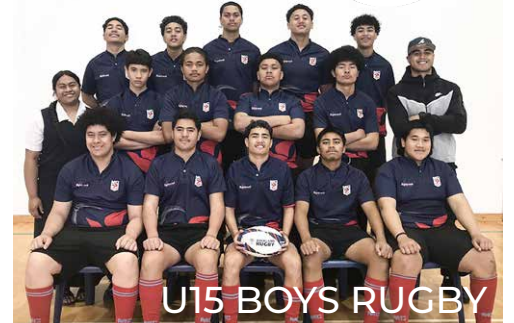
U15 BOYS RUGBY