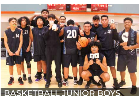
BASKETBALL JUNIOR BOYS