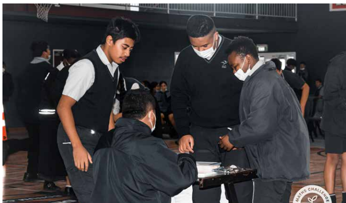
SOUTH AUCKLAND MATHEMATICS COMPETITION