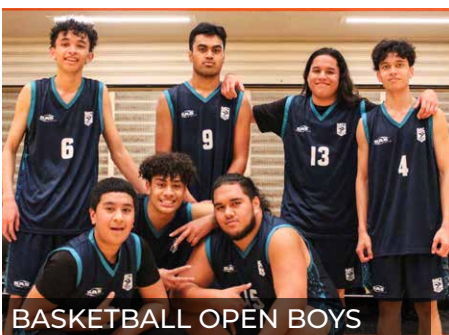
BASKETBALL OPEN BOYS