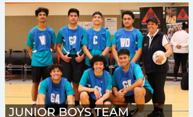
JUNIOR BOYS TEAM