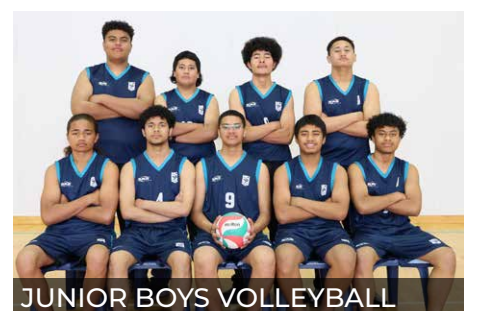
JUNIOR BOYS VOLLEYBALL