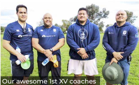
Our awesome 1st XV coaches