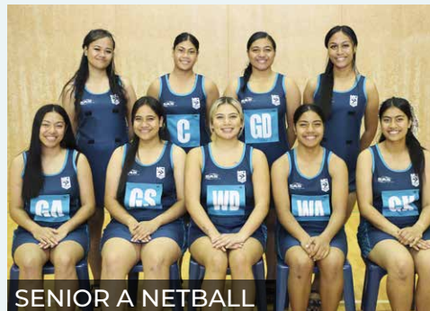
SENIOR A NETBALL