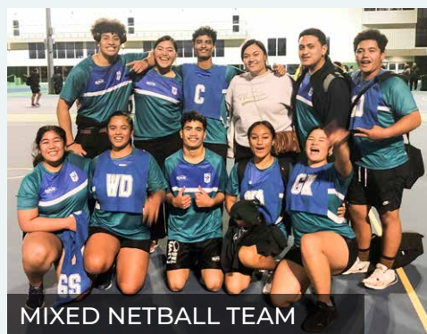
MIXED NETBALL TEAM