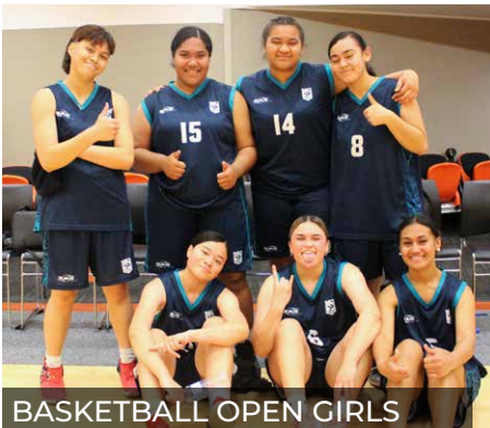
BASKETBALL OPEN GIRLS