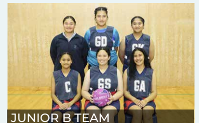
JUNIOR B TEAM