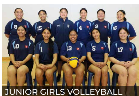
JUNIOR GIRLS VOLLEYBALL