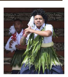
RESULTS: OVERALL PLACING - 3RD LAKALAKA - 3RD FAHA'IULA - 1ST