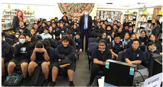
Thank you to our local schools Bader Intermediate, Mängere Central School, Viscount Primary and Koru School for visiting our school during our Open Week.