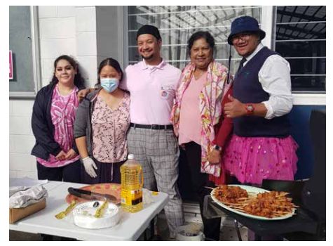
FOLLOW our business groups on IG: @13teen.aestival @alchemist.candles @jinglezkeychains (below)