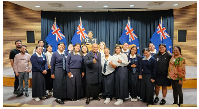
Year 13 Business students in Parliament for the annual Business Trip to Wellington.