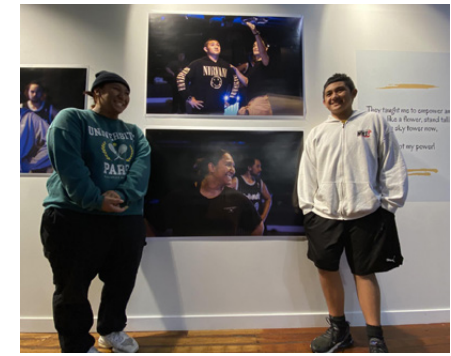
explore what Tōku Whakaruruhau means to you and your whānau.