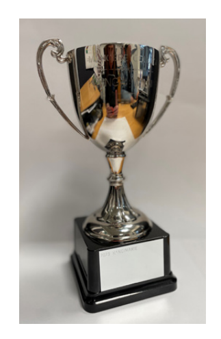
KĀINGA POINTS TERM 2 (so far)