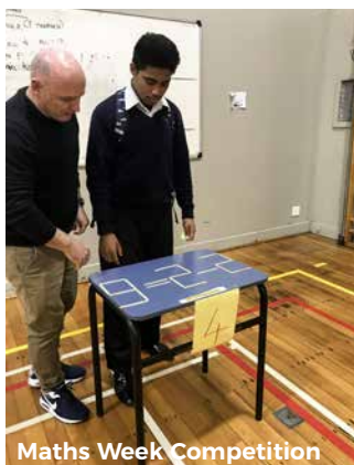
Maths Week Competition