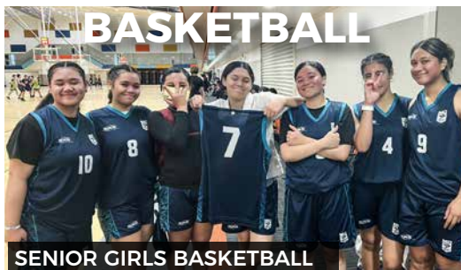
SENIOR GIRLS BASKETBALL