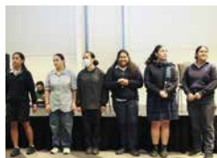
Scan the QR code below for Haura Dinner pics!