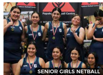
SENIOR GIRLS NETBALL