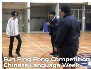
Fun Ping Pong Competition Chinese Language Week