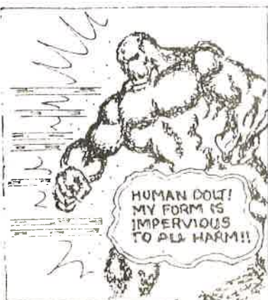
WHAT!? MY GRILLS HAVE NO EFFECT ON IT, MAYBE PRIME STRENGTH IS NEEDED!