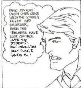
OUR HERO CONTEMPLATES THE SITUATION.