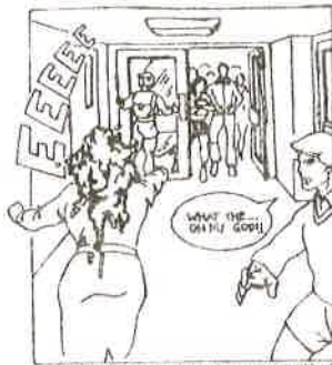
AS THE FINAL FIGURE OF MISS DRUCKE RINGS IN PANIC STRICKEN TERROR...