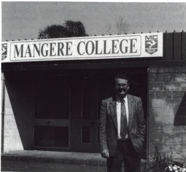
Kia Ora, Kia Orana, Talofa, Fakalofa Lahi Atu, Malo e Lelei, Greetings to All.

This year has been an exciting and challenging one for staff and students alike. There have been many difficult changes and pressures in the community over the last few years and these have been visited upon the education system. However, one thing that has not changed is the importance of education. While the daunting monster of unemployment is such a big issue the only solution to be offered to personally escape its clutches is to 'gain a high level of skill'.