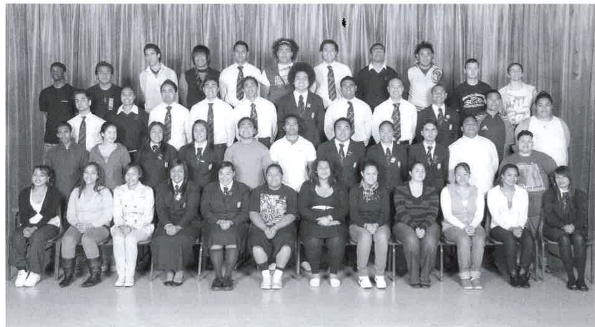
The class of '08