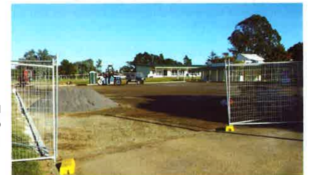
Preparatory work on the new car park.