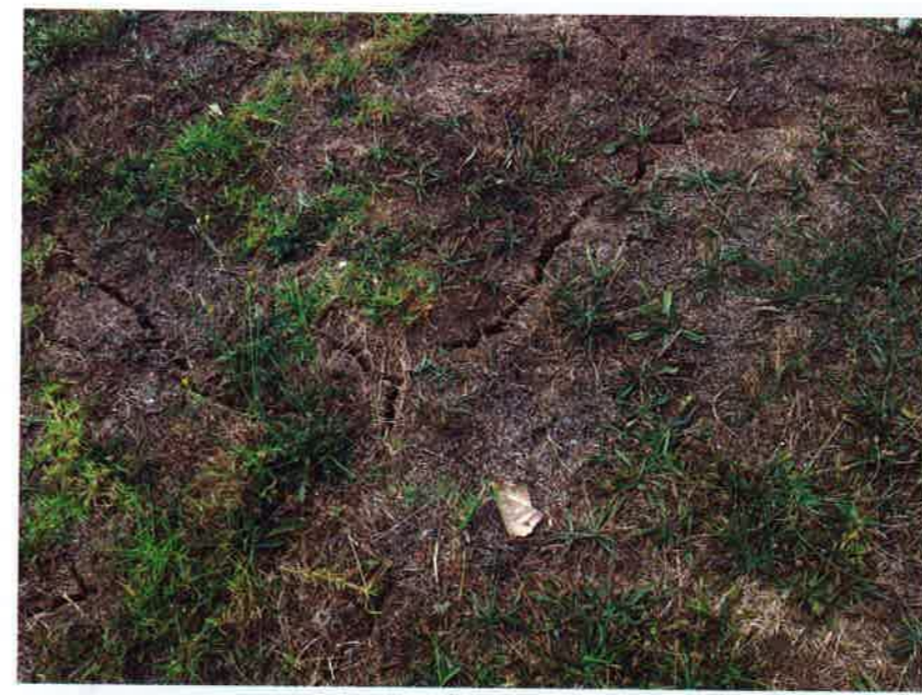
The "big dry" of summer 12/13