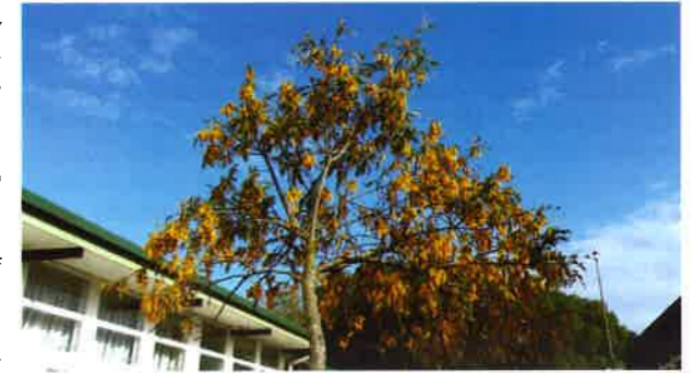
Spring-time at MC

At this year's Polyfest we were delighted with the way that every group performed and had much pleasure when once again our Cook Island Group placed 2 nd in their competition in a stunning display of cultural musicality and choreography and our Samoan group gained 3 rd place in the co-ed section.