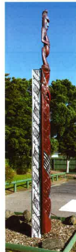
The repainted pou

And on top of all this the college had the largest number of students ever winning sporting places beyond school teams: with 20 students gaining regional honours with 3 being reps in two sporting codes and 5 students becoming national sporting representatives, all of whom were acknowledged at our Sports Awards Evening. (ref. p 50)