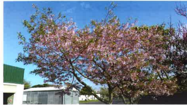
Spring-time at MC

Certificate, with 28 students having gained more than 60 credits, 5 having gained more than 70 credits and one student who had already gained the necessary 80 credits for level 1.