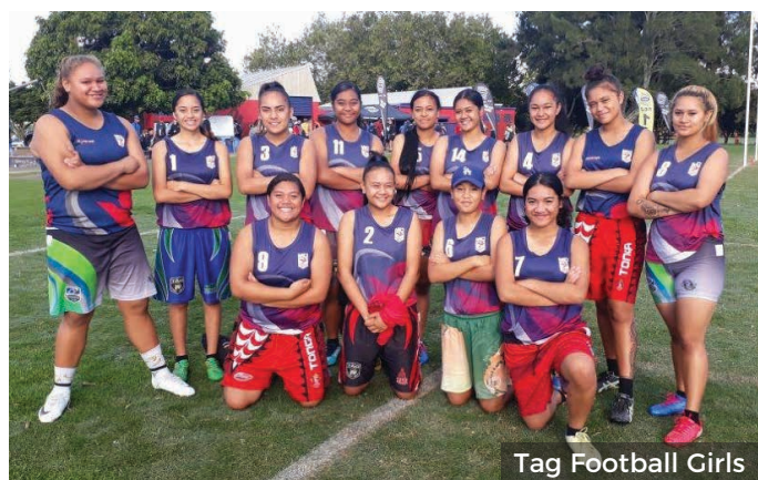
Tag Football Girls