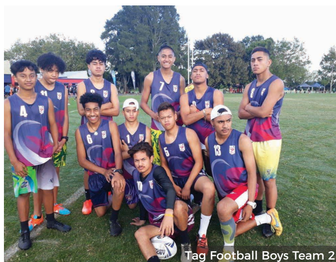
Tag Football Boys Team 2