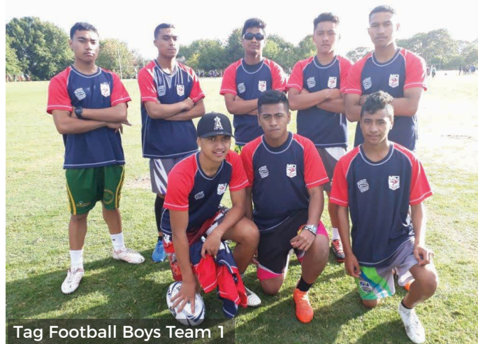
Tag Football Boys Team 1

Senior Girls were placed 5th in Division 2 Senior Boys 2 were placed 6th in Division 2 Only teams in Division 1 were able to qualify for the Auckland Champs.