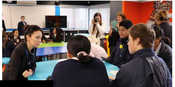
MC Media students meeting Prime Minister Jacinda Adern in Rotorua

Facebook: @mcmmediacub | Instagram: @mangerecollege.media Youtube: Mangere College Media | Meetings every Wed Lunch in H4 - all welcome!