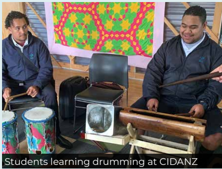
Students learning drumming at CIDANZ