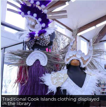
Traditional Cook Islands clothing displayed in the library