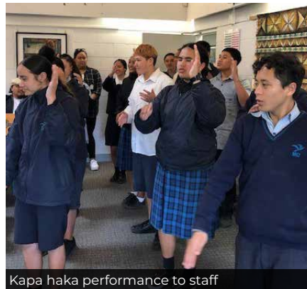
Kapa haka performance to staff