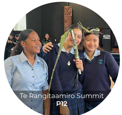
Te Rangitaamiro Summit P12