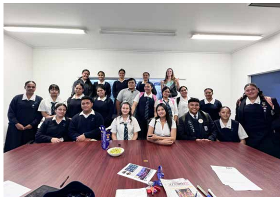
The MC Media crew meet every Wednesday Break 1 (location varies)

MC Media has been bustling with activity this term, capturing moments at Polyfest, Athletics Day, Excellence Assembly, and volleyball games. Stay updated with our student-run Instagram account: @mangerecollege.media